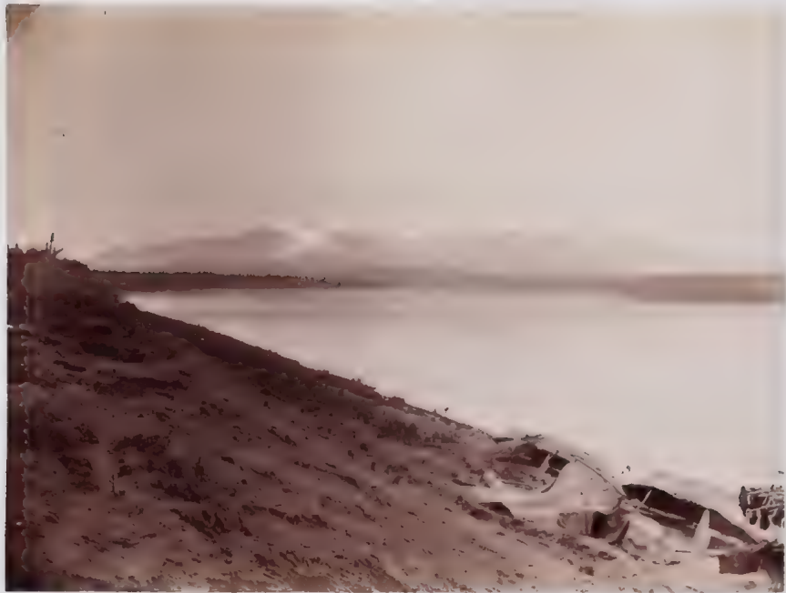
| 28. Kuskokwim river from Kolmakovsky. |